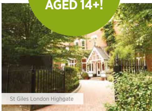
St Giles London Highgate